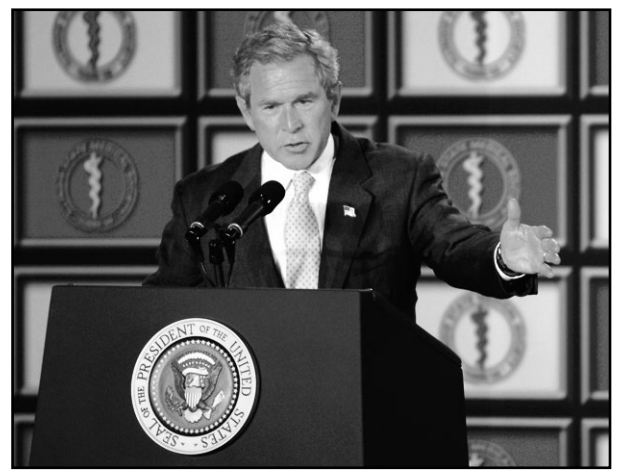
The current system is endangering the right to choose one's own physician, said President Bush, shown speaking in Chicago on June 11.

CONGRESS SIGNALED A RESPONSE TO THE presidential challenge late in June when the U.S. House passed the House Medicare Prescription Drug and Modernization Act of 2003 (H.R. 1). This bill provides the prescription drug coverage needed by many seniors, as well as provisions to address the immediate Medicare physician payment cuts threatening seniors' access to care. The House