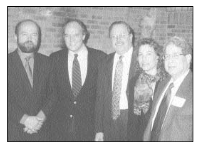
Irving Park members host brunch for Senator Peter Fitzgerald

For details on the ISMS HOD see the ad on page 10, or e-mail rbennett@cmsdocs.org