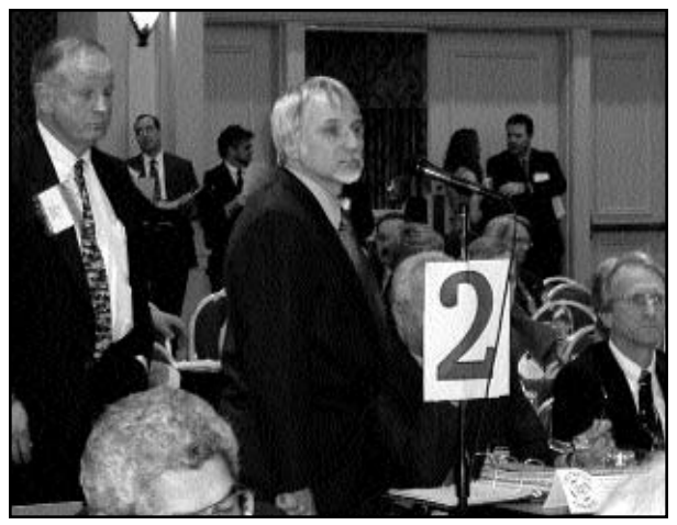
Delegates raise questions during an HOD session.