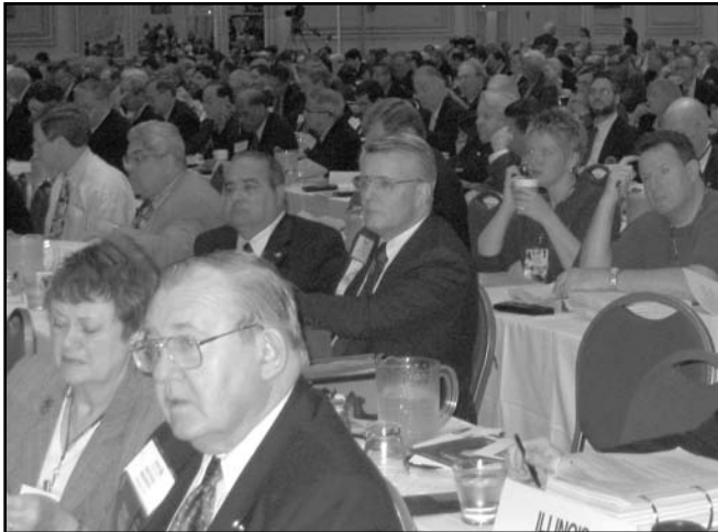
CMS members, part of the ISMS Third District delegation, listen as our organization's resolutions undergo debate at the AMA annual meeting.

THE AMA'S 544-MEMBER HOUSE OF DELEGATES met June 10-14 in Chicago to set a course for shaping and influencing the country's health-care agenda and the medical profession's stand on emerging health care issues.