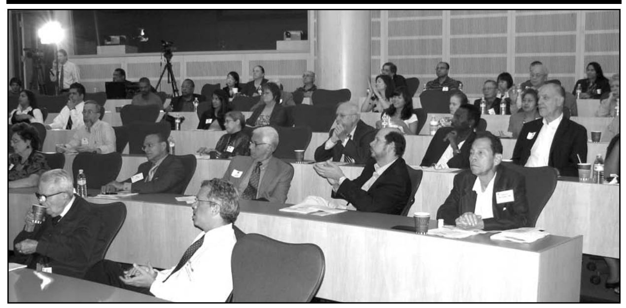
More than 100 physicians from the Chicago area signed up for the Telemedicine program at Northwestern, earning three hours of CME credit. The program was well received by attendees.