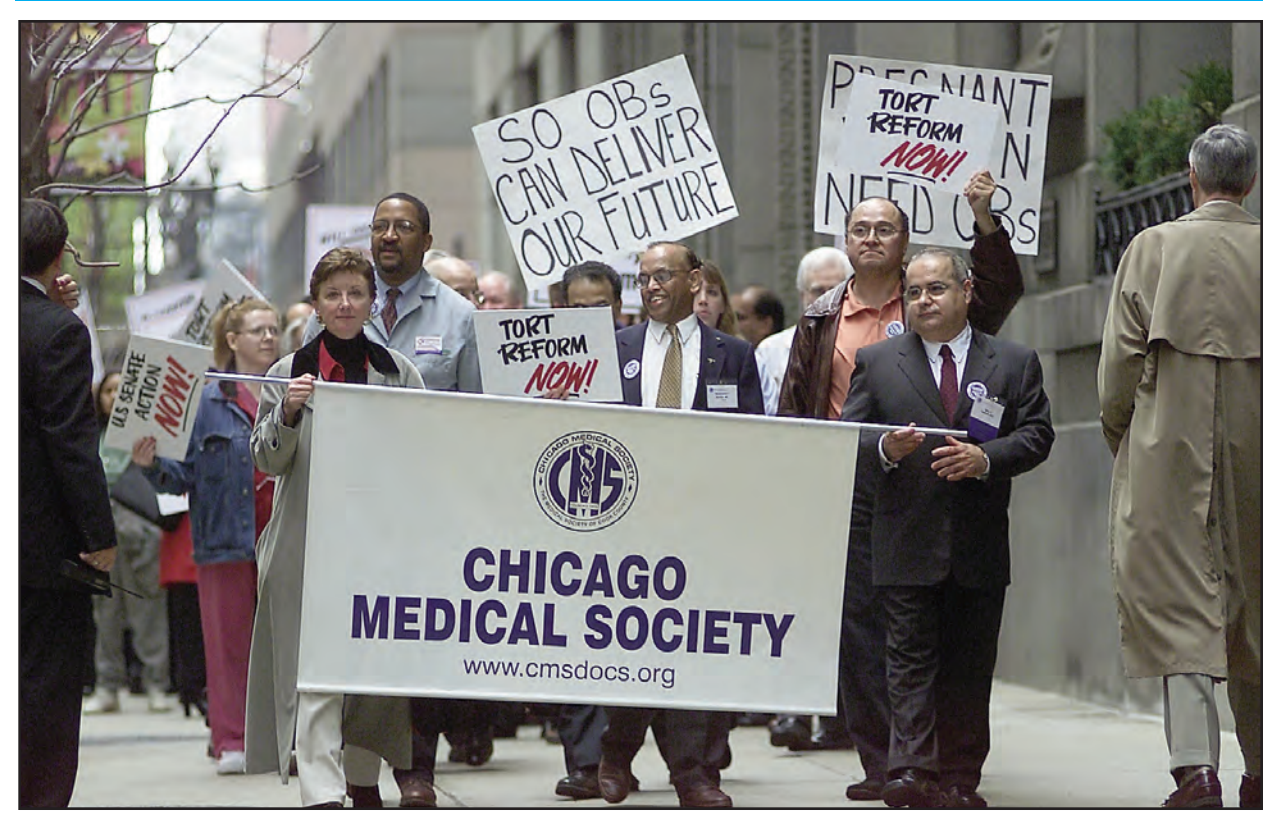
Shouting "Tort Reform Now!" physicians show their concern as they make their way through downtown Chicago in an historic CMS-sponsored rally on March 26, 2004.